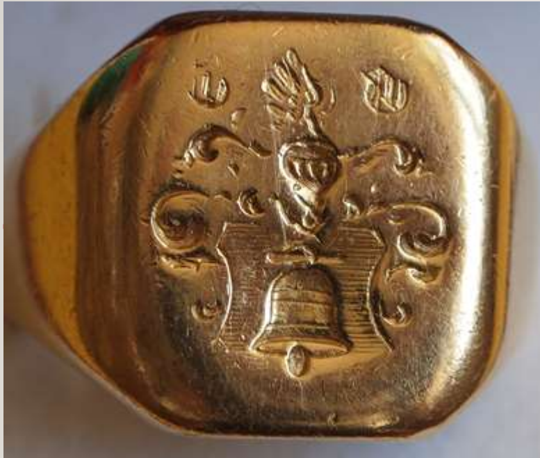
TÖNNIES FAMILY COAT OF ARM