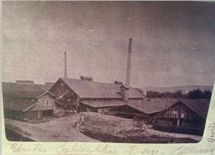
THE KOSEZE BRICKWORKS