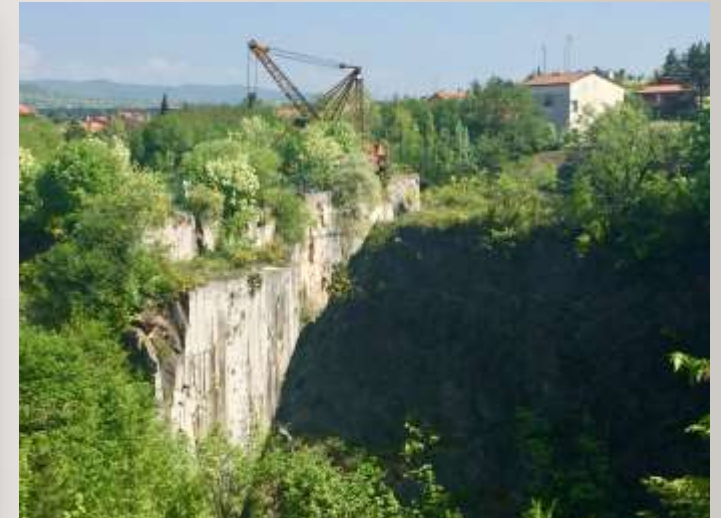
THE NABREŽINA QUARRY